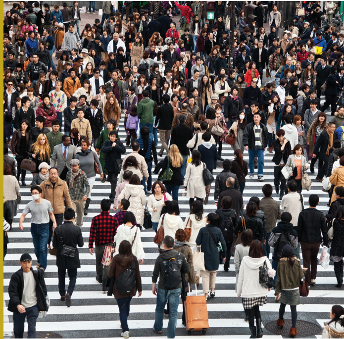
Pedestrians in Tokyo, Japan

Urban and territorial planning can contribute to sustainable development in various ways. It should be closely associated with the three complementary dimensions of sustainable development: social development and inclusion, sustained economic growth and environmental protection and management.