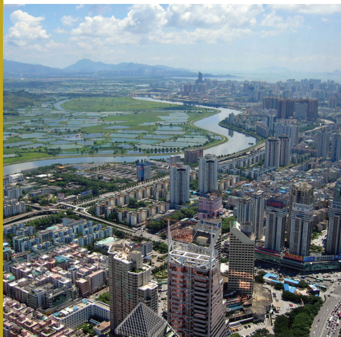
Aerial view of Shenzhen, China