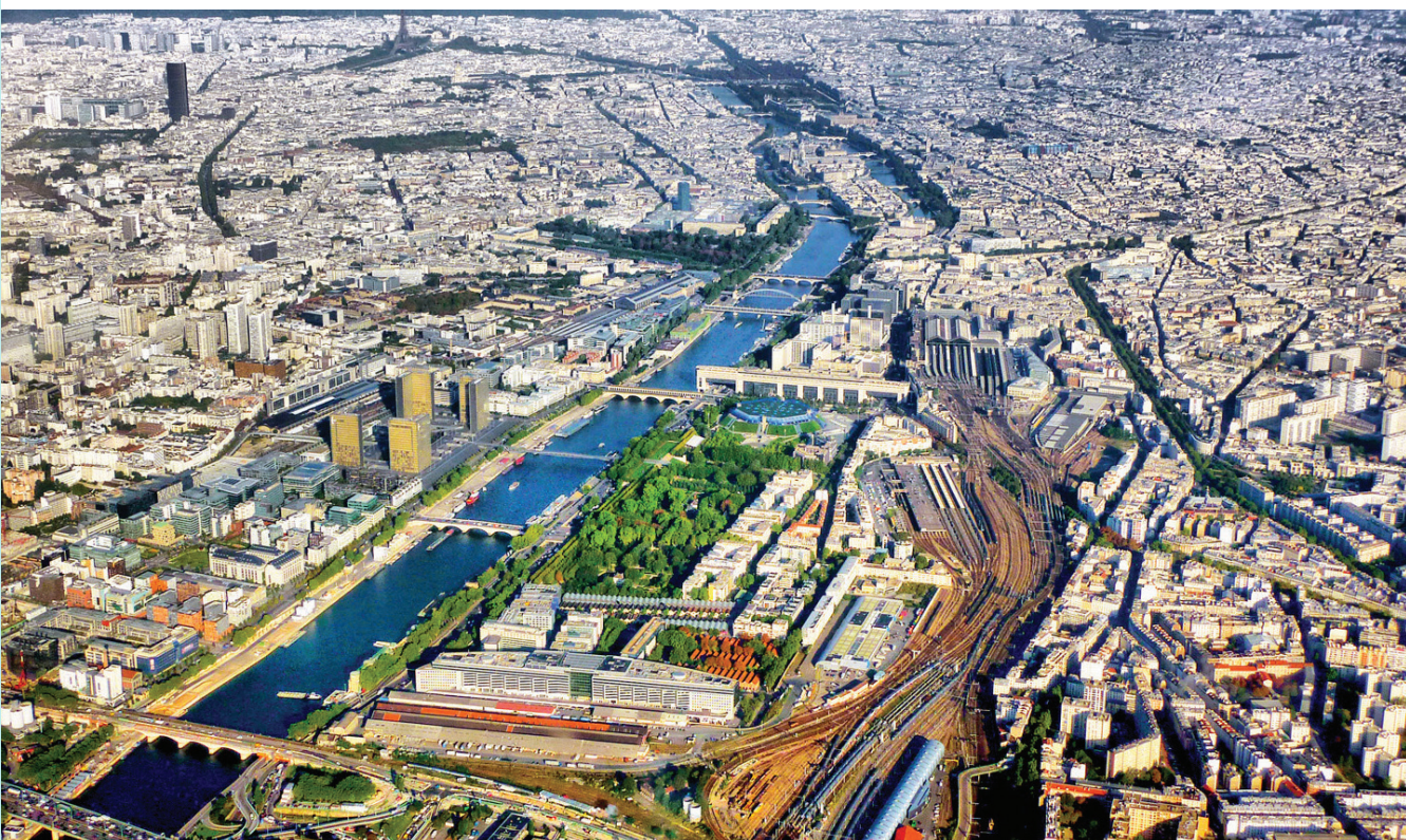
Aerial view of Paris, France