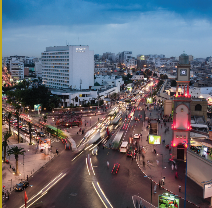
Place of United Nations in Casablanca, Morocco