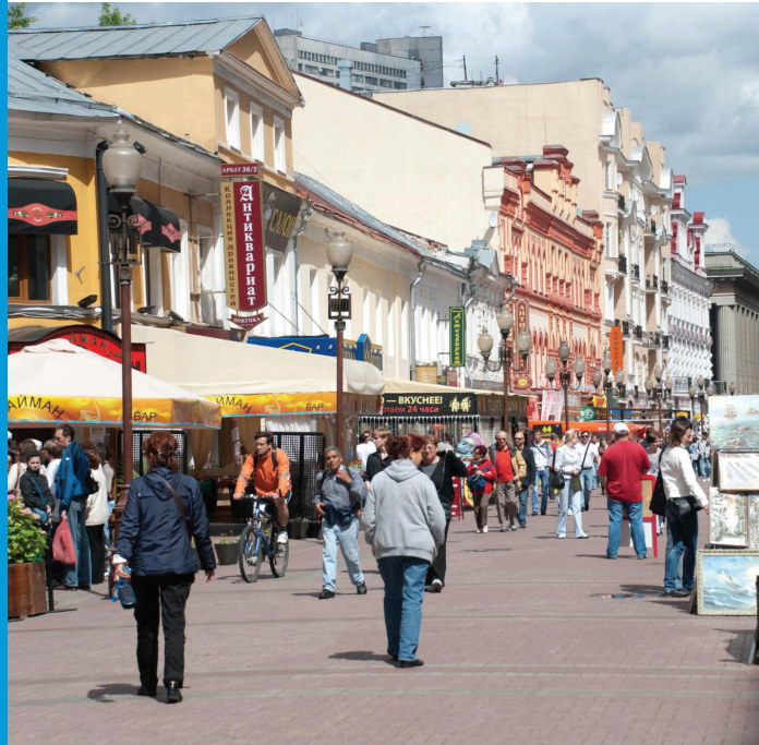
Pedestrian street in Moscow, Russia