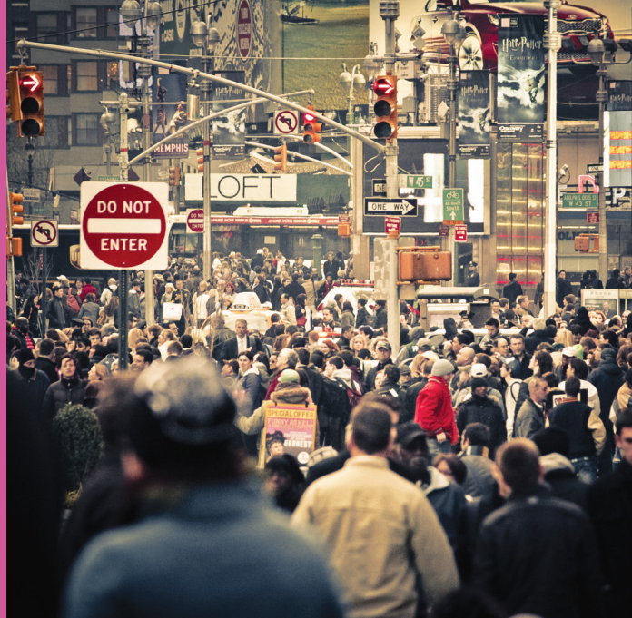
Street in New York, USA