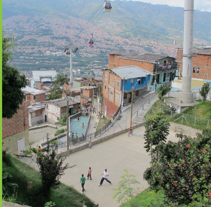
Public space in Medellín, Colombia