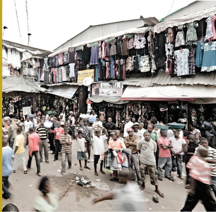
Market place at Onitsha, Nigeria